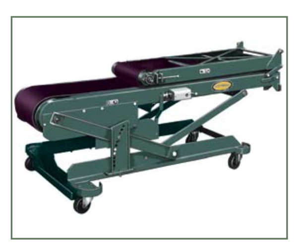
HINGED BED FOLDS FOR EASY STORAGE