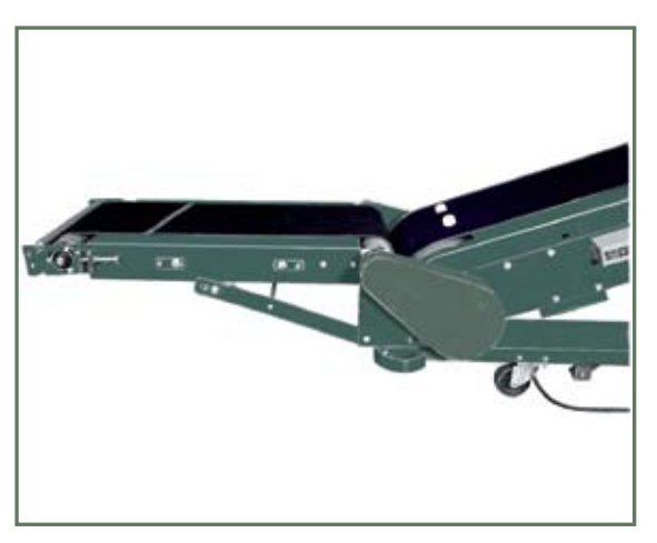
LOWER POWERED FEEDER

CAPACITY-300 lbs. total distributed load, 150 lbs. unit load at 65 FPM.